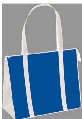
Tote Bag, $5

Sale sponsored by Waukesha Catholic Home and School