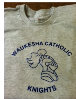
Knights Short Sleeve T-shirt, Silk Screened, $10

Sale sponsored by Waukesha Catholic Home and School