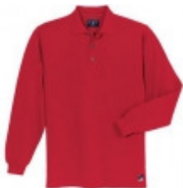
Long Sleeve Polo, Red, White or Navy, $20 -22